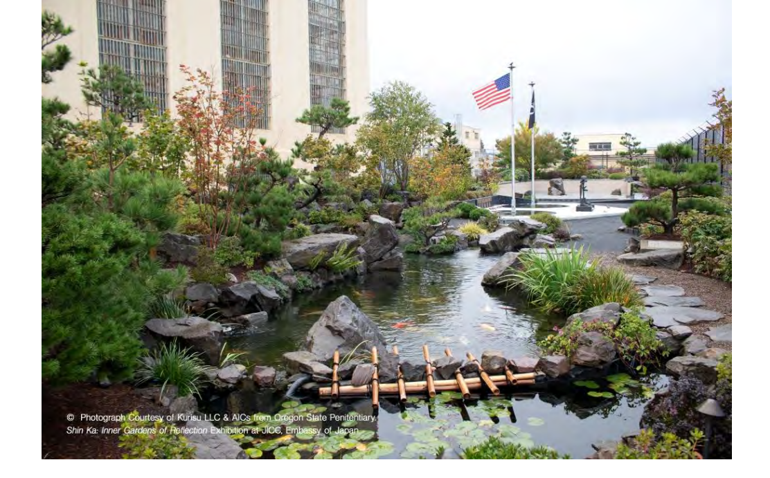
Shin Ka: Inner Gardens of Reflection Ongoing

The Japan Information & Culture Center, Embassy of Japan (Washington, DC)