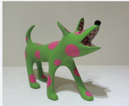
Yayoi Kusama. Sho-chan , 2013. © Yayoi Kusama, Courtesy of Ota Fine Arts, Tokyo/Singapore/Shanghai

Date/Venue: Sun., Jun. 2 — Sun., Aug. 18, 2019 - National Gallery of Art, Washington Sun., Sep. 22 — Sun., Dec. 8, 2019 - Los Angeles County Museum of Art Organizers: The Japan Foundation, National Gallery of Art, Washington, Los Angeles County Museum of Art Special cooperation: Tokyo National Museum Cooperation: Chiba City Museum of Art, Suntory Museum of Art