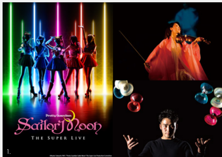
1. © Naoko Takeuchi, PNP/Production Committee of "Pretty Guardian Sailor Moon" The Super Live

"Pretty Guardian Sailor Moon" The Super Live will also be presented in New York on March 29 & 30.