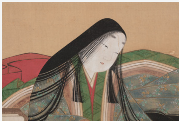
Tosa Mitsuoki. Portrait-Icon of Murasaki Shikibu (detail). 17th century. Ishiyamadera Temple.

Date: Tue., Mar. 5 — Sun., Jun. 16, 2019 Venue: The Metropolitan Museum of Art Co-organizers: The Metropolitan Museum of Art, The Japan Foundation Special cooperation: Tokyo National Museum, Ishiyamadera Temple